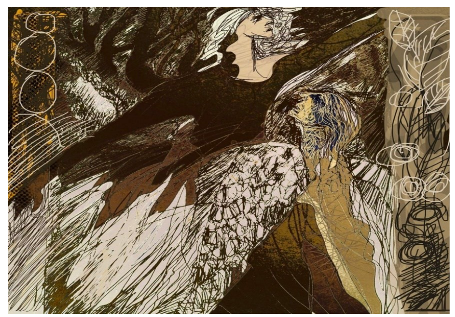
Figure 2: By Steinunn Bessason (2023)

While pregnant women endure the "long nights" of nine months with a mother's hope to enter the delivery room, Óðinn the "All Father" mocks feminine divinity by enduring "nine long nights," foregoing nine months, to enter the delivery room of wisdom. Irony drips with his blood, as Óðinn pronounces the use of his sacrificial spear Gungnir (quaint naming of a phallic symbol) which is fashioned from Yggdrasill's branches. These are the very same branches from which practitioners of <code>seiðr</code>, of women's magic, receive their staffs. Throughout the Eddas, there are whispers of derision should any man practise seiðr, but here? Óðinn's punishment for seeking women's magic? He, the new usurper of divine feminine identity, dons his cloak of hubris, warm in a newfound awakening and utmost authority. Óðinn, the storyteller, is rebirthed on "that tree of which no man knows/from where it's roots run" (v. 137). In Larrington's translation of "The Seeress's Prophecy," the Seeress, with grace and beauty, to whom