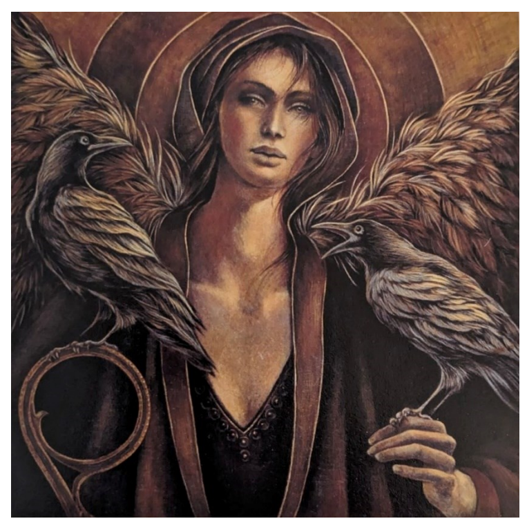
Figure 4: The Messengers by Nicole Nixon

duction of written work. For, "if the state is what binds, it is also clearly what can and does unbind. And if the state binds in the name of the nation conjuring a certain version of the naforcibly, if tion not powerfully, then it also unbinds. releases, expels, [and] banishes."22 The historical figures of the author, the work, and even the reader, are often assumed masculine, which is why the voice of the feminine within texts is submerged.