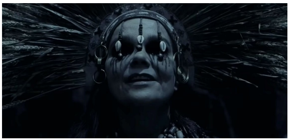
Figure 3: Icelandic actor and musician Björk as Seeress in The Northman (2022)