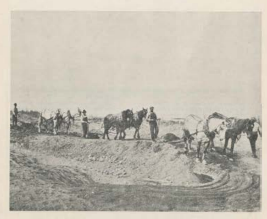
Building roads with drag scrapers and teams during World War I period