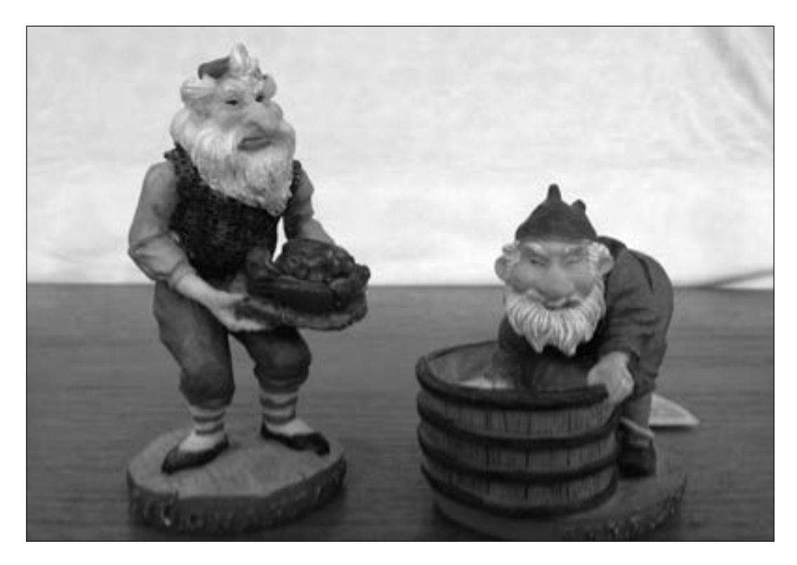
Bjúgnakrækir and Skyrgámur

During my stay in Iceland, I drove around the country on the famed ring road, exploring fishing villages in the north, viewing puffins from atop windswept cliffs in the West Fjords, climbing mountaintops