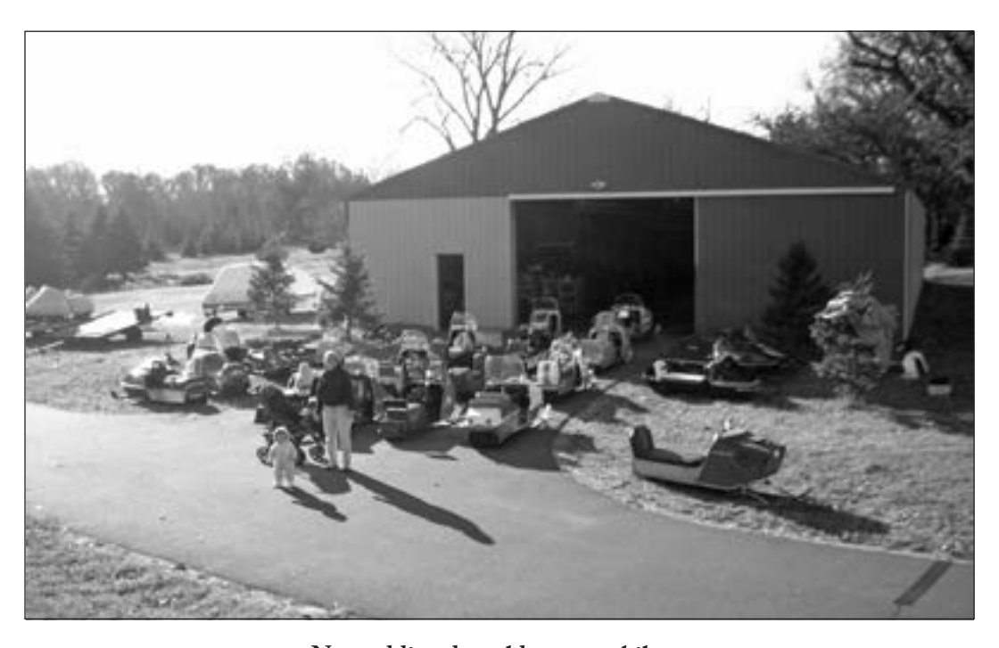
Now addicted to old snowmobiles...

At vintage rides around here, my greatest joy is to have someone come up and say that they have never heard of the snowmobile brand that I am driving. It gives me a chance to discuss these Western Canadian models and the good-old days. And to think, it all came about because of a very special Christmas present. The magic of Christmas!