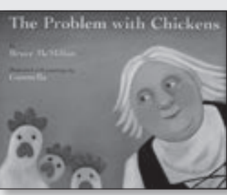
The Problem with Chickens BRUCE MCMILLAN ILLUSTRATIONS BY GUNNELLA $19.95 CDN