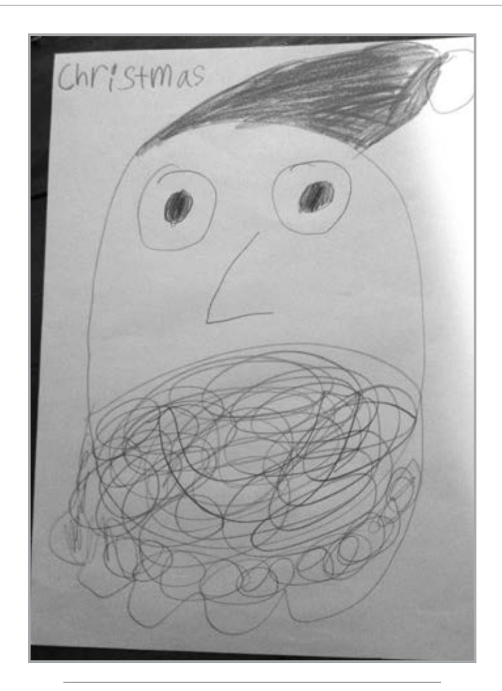
The Back Page